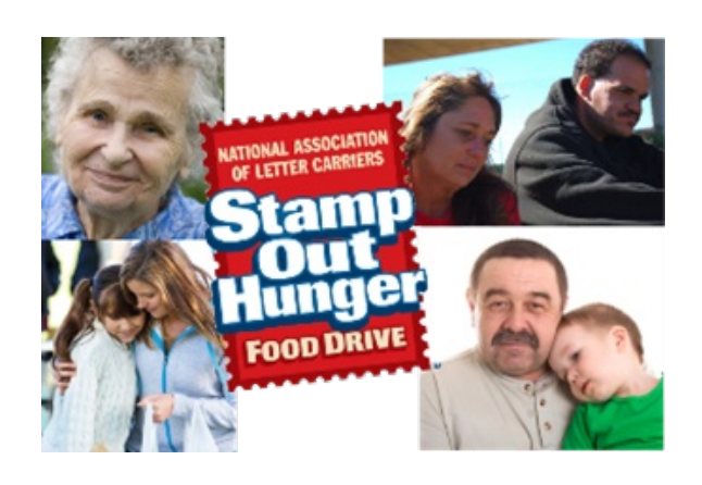
Learn More about Stamp Out Hunger

What you give in our community stays in our community. Their goal is to collect 100,000 pounds of food in one day!